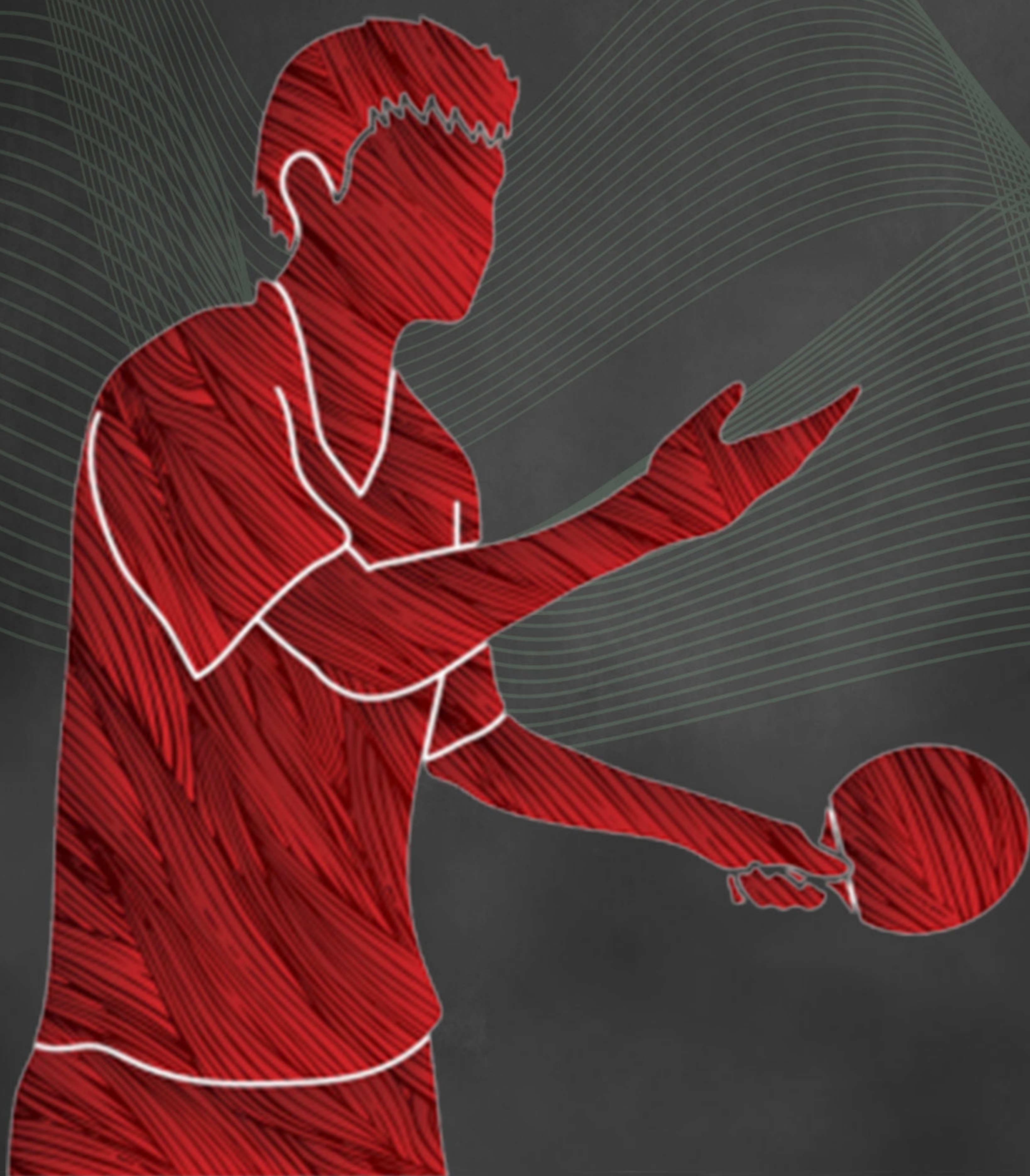
Table Tennis is a perfect combination of violent action taking place in a total atmosphere of tranquility. Of course you must have a lot of physical activity, but you can't play tennis well and not be a good thinker. You win or lose the match before even you go out there. You always want to win. That is why you play tennis, and try to do the best you can do to it.